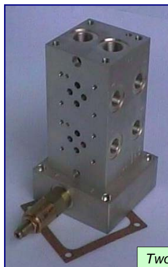
Two Station Cetop3 with a Tanktop Adaptor and gasket