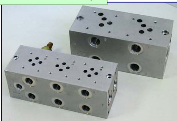
Three Station Cetop3 with Relief and Two Station Cetop5

Our range of Cetop Multi-station Manifolds are the flagship of the full range of quality Hyteco Standard Products. We have endeavoured to provide innovative options and features in our Cetop Multi-station Manifolds that allow adaptability and flexibility in application, as well as all the standard industry functions.