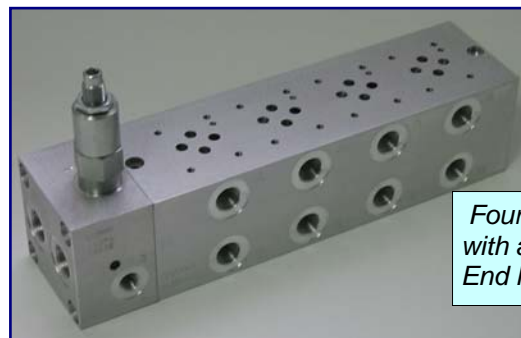
Four Stn Cetop3 with a Priority Flow End Module

Contact our Engineering people and discuss your particular requirements.