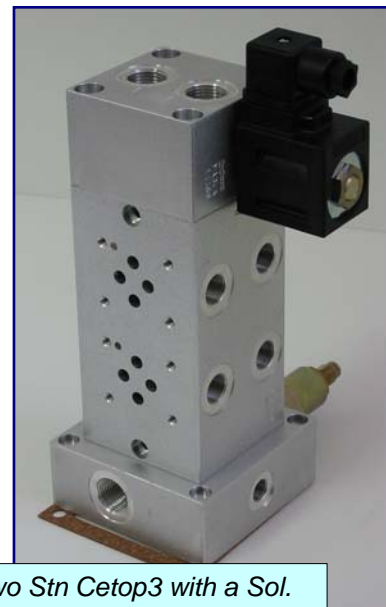
Two Stn Cetop3 with a Sol. Unloading End Module and Tanktop Adaptor